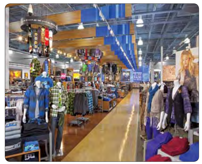
Jason VanB Photography, New York City

The new prototype for Bob's Stores creates a flexible environment that can be easily adapted while focusing on Bob's "house of brands" business and value positioning. Working with a very limited budget, the design team overhauled and updated the look and feel of Bob's with a simple but powerful design that can be enhanced by the retailer's visual team. Movable interior walls allow the entire 33,991-sq.-ft. store to be reconfigured in a few hours. A perimeter frame-and-rail system create a flexible hierarchy for vendor-provided graphics, while end-of-aisle focals allow for more opportunities to promote brands in a controlled environment.