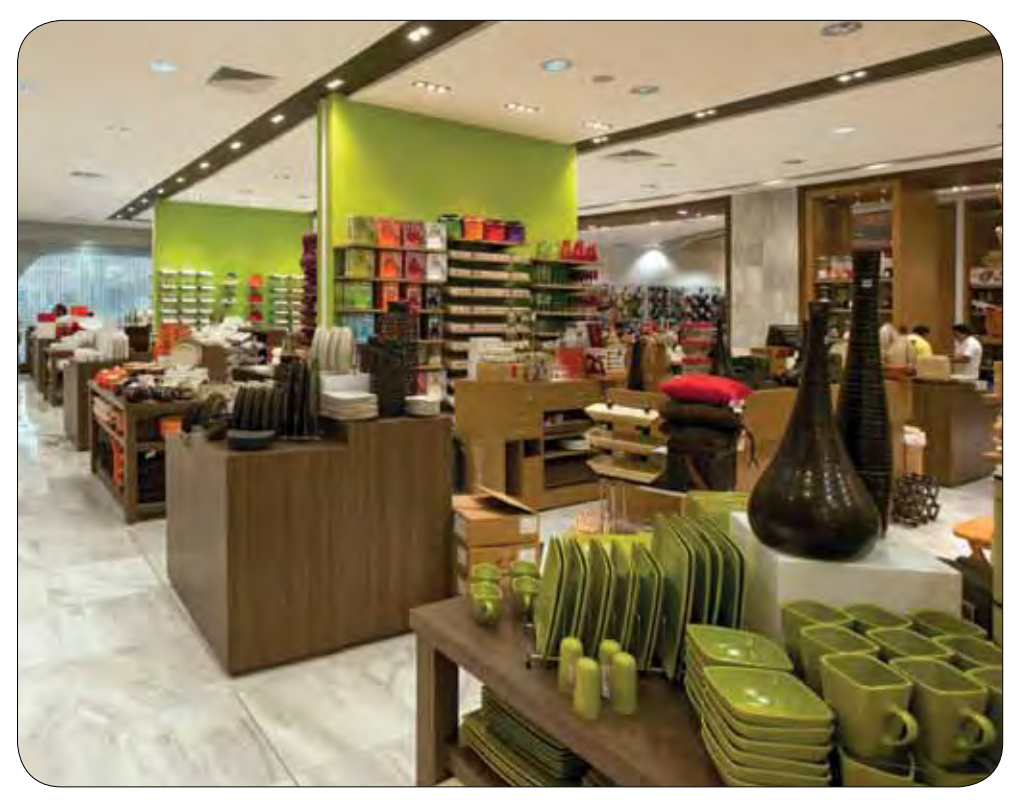
Architectural focals help create a home for the different merchandise categories.

The first floor, the fashion floor, is a contrast between black and white. The second floor changes to neutral wood tones and includes the use of bright