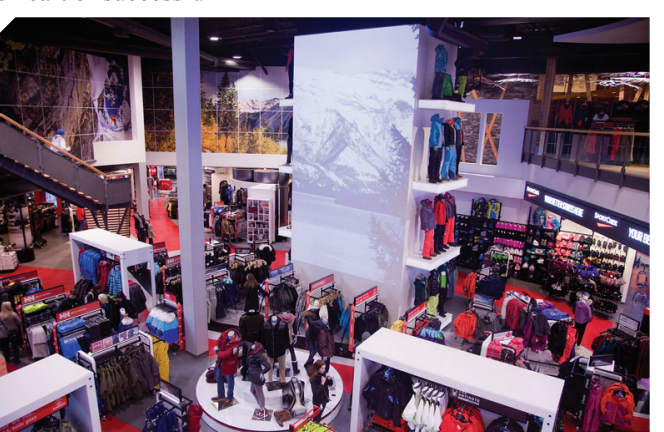
Interactive technology and digital installations are woven throughout Sport Chek's flagship in West Edmontall Mall, Edmonton, Alberta.